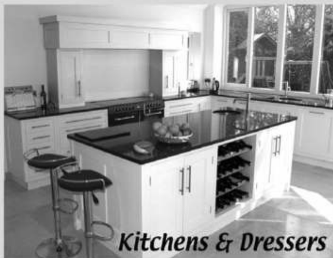
Kitchens & Dressers